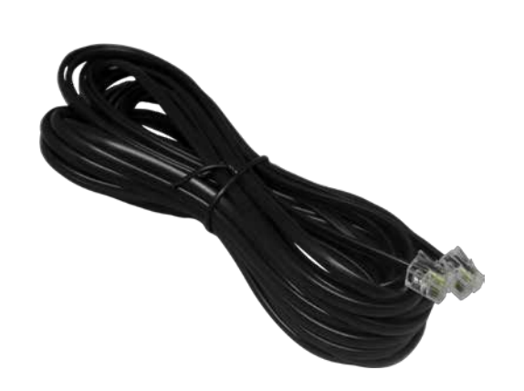
Pic. 5 - RJ11 Cable

Same channel has to be selected on the headsets to listen what is being broadcasted.