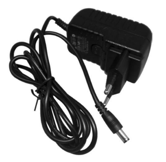
Pic. 2 - Power Supply

It's recommended to unplug the power supply from the electricity if the transmitter is not in use.