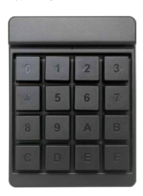
Pic. 4 - Keypad

In order to have access to a series of advanced The keypad makes possible the following functions a Keypad* (Pic. 4) has to be connected to the Keypad Plug on the transmitter.