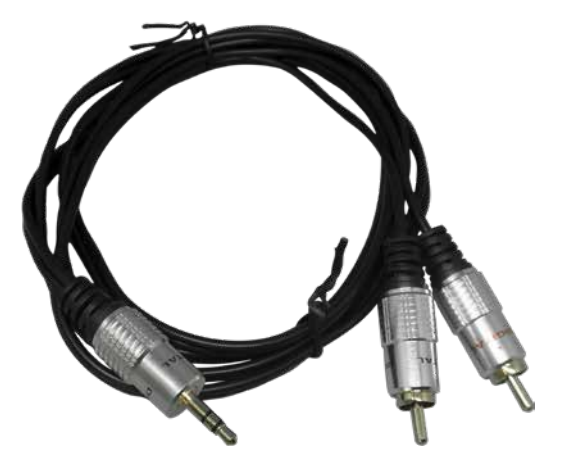
Pic. 3 - 3.5mm - RCA Adapter

This means that if you have another type of cable, you'll need an adapter. Usually the majority of the devices have a 3.5mm output, so in most cases you'll need a 3.5mm - RCA adapter (Pic. 3)*.